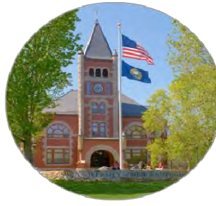
Durham (Main Campus)