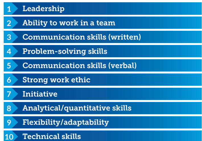
Figure 2: Attribute (Top 10 in order of demand)

Modified from: The National Association of Colleges and Employers Job Outlook 2016 (NACE, 2016)